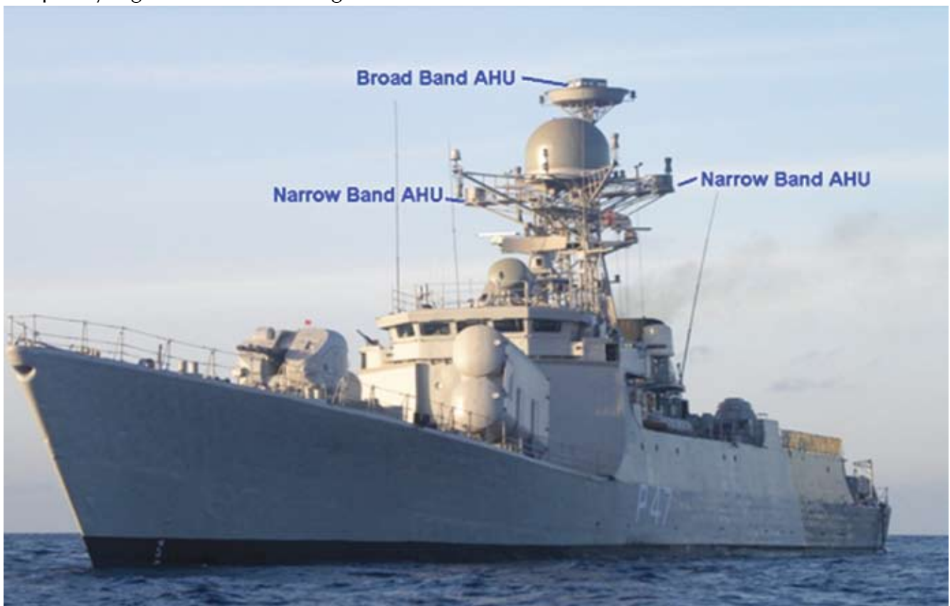
Varuna Engineering Model Onboard INS Khanjar

Convoy Protection Jammer System 'Stride': Vehicle Mounted Muting System designed to prevent detonation of Radio Controlled Improvised Explosive Devices (RCIEDs) employed by Anti National Elements. These Systems are intended for the protection of Security Convoys of VVIPS from RCIED