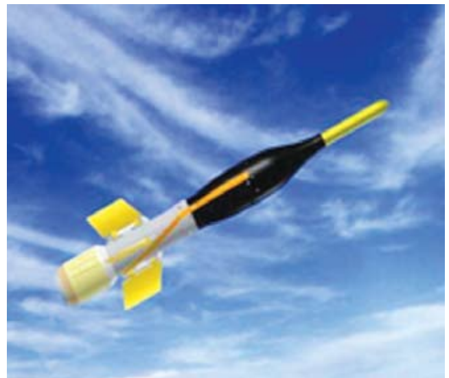
MILAN -2T ATGM