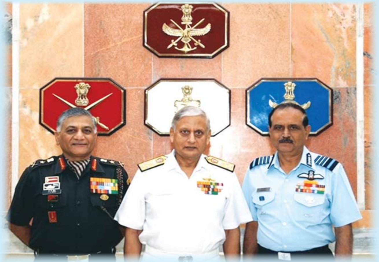
Chiefs of Staff Committee