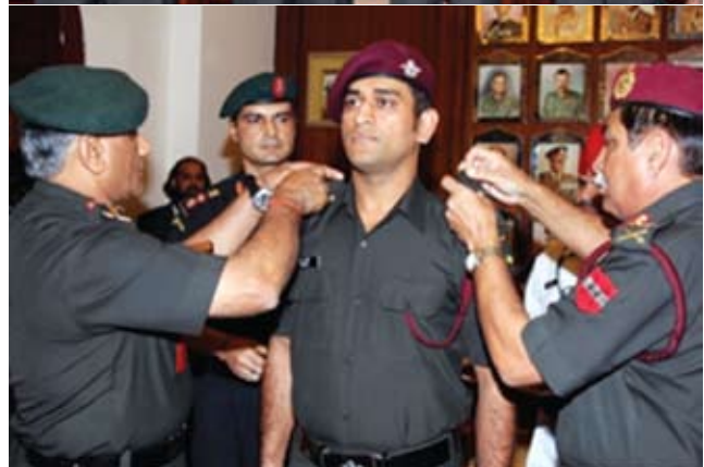
New Entrants to the Armed Forces family