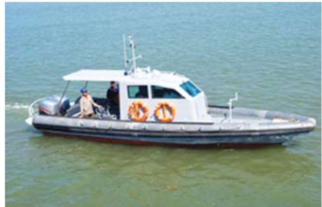
5T GRP boat

7.61 The yard is in the process of implementing a modernisation plan to meet the future challenges in terms of technology and workload. This is being carried out in four phases at an estimated outlay of Rs.800 crore. Commissioning of Phase 1 & 2 comprising of setting up of 6000T shiplift system along with building berths & jetty and laying of foundation for phase 3 & 4 was done by Raksha Mantri on May 21, 2011. Facilities planned under phase 3 & 4 include new hull fabrication and outfitting shops for modular construction and GRP complex for building of MCMVs for Indian Navy.