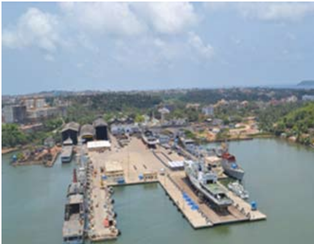
Birds eye view of facilities under Modernisation phase 1 & 2

shipbuilding projects are based on in-house design, an outcome of R&D over 30 years. It is noteworthy that GSL's indigenously developed designs of Patrol Vessels have saved the country considerable amount of foreign exchange by avoiding import of ships/ designs. This has also given an impetus to the country's efforts towards self reliance in ship design.