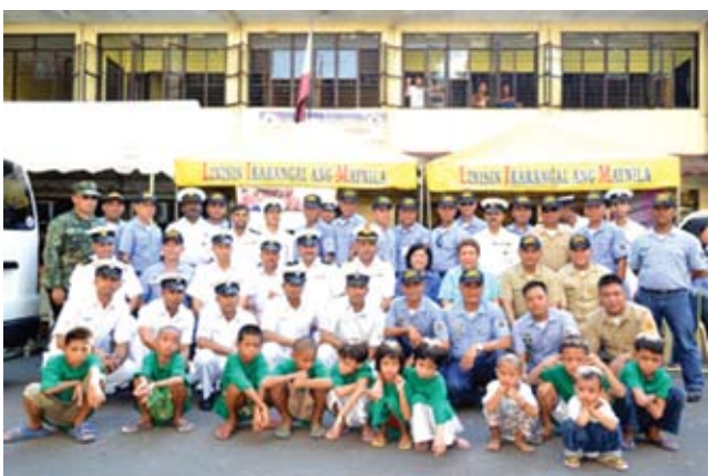
Lending a helping hand to an orphanage at Manila, Phillipines

4.6 Overseas Deployments: Overseas Deployments (OSD) are undertaken by IN ships for flag showing, fostering better relations with friendly countries and enhancing foreign cooperation. Important overseas deployments in 2011 included the following: