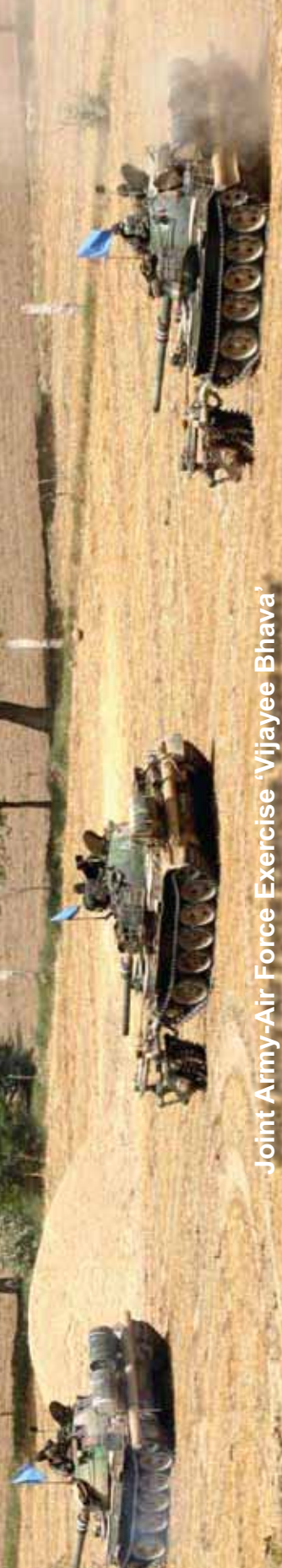
Joint Army-Air Force Exercise 'Vijayee Bhava'