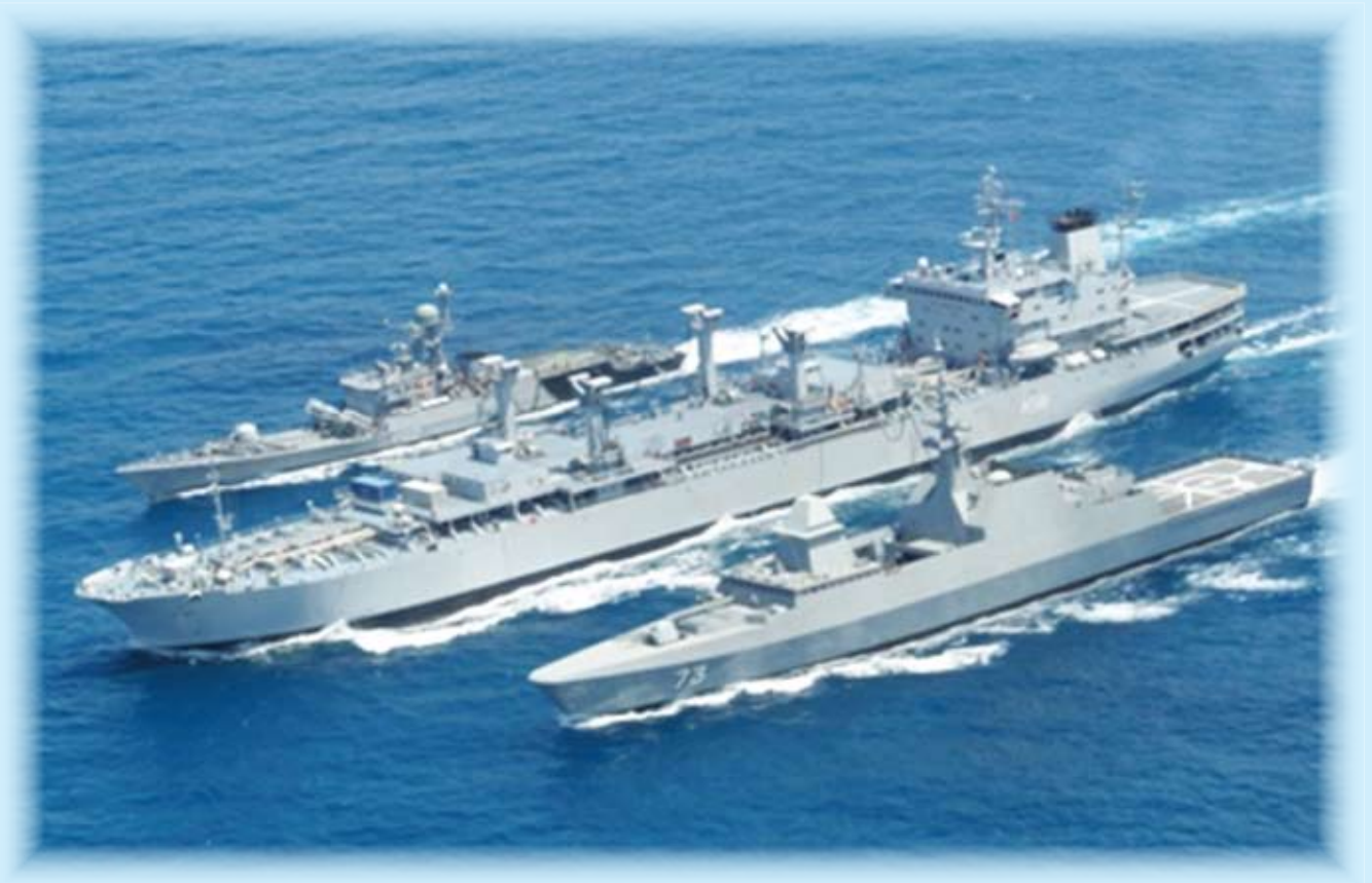
INS Jyoti , RSS Supreme and INS Kirch