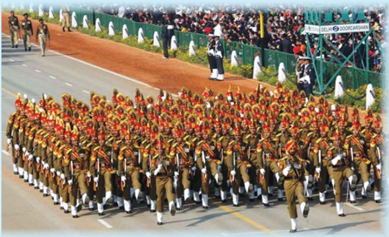
Republic Day Parade-2012