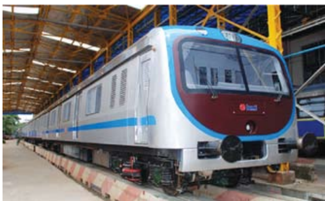
STAINLESS STEEL EMU