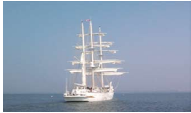
Sail Training Ship

7.60 During the year, 1 Sail Training Ship for Indian Navy and 1 GRP boat for Sardar Sarovar Narmada Nigam Limited have been delivered.