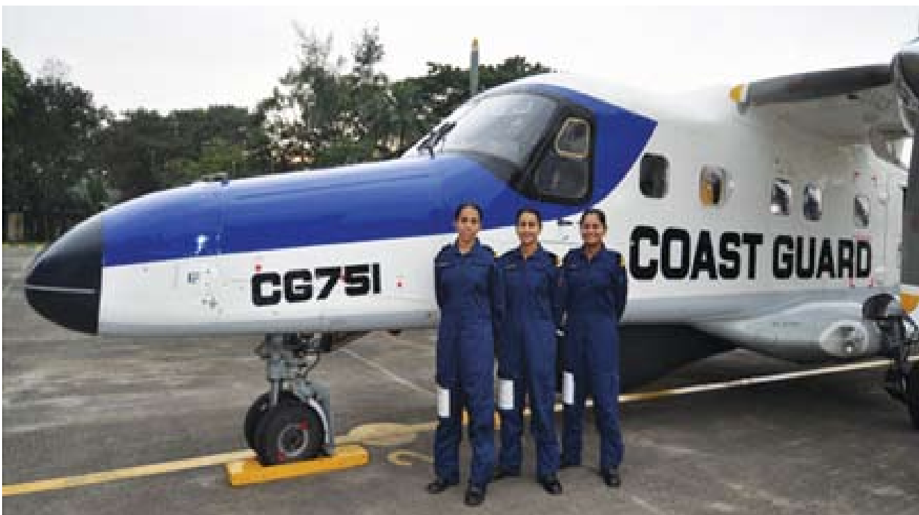
Women Coast Guard trainee pilots

17.17 Women Officers in Coast Guard: Women officers are being inducted in the Indian Coast Guard as Assistant Commandant since 1997. Women candidates can join the Indian Coast Guard in the General Duty (Permanent), General Duty (Pilot/ Navigator) and General Duty (Law) branches. Short Service appointment for women officers in General Duty and General Duty (CPL Holders) branches has also been introduced to increase the intake of women officers in the service.