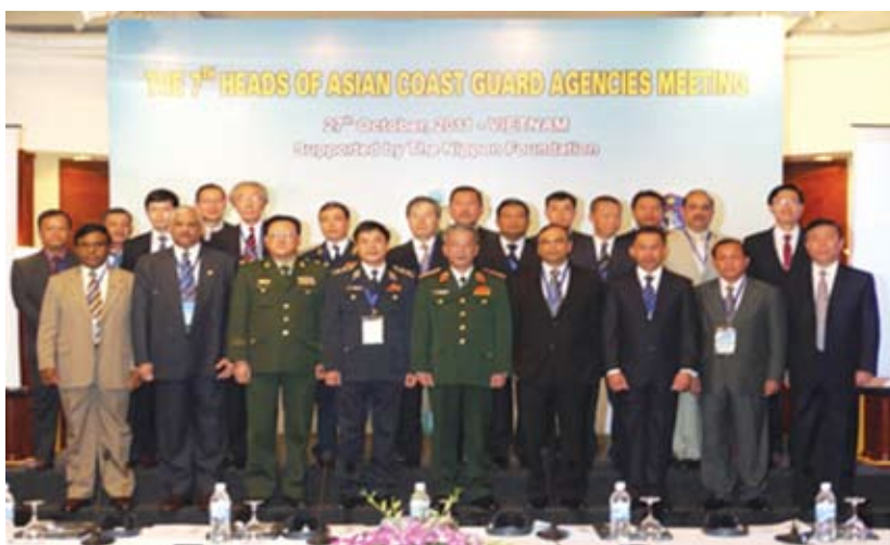
7th Heads of Asian Coast Guard Agencies Meeting (HACGAM)