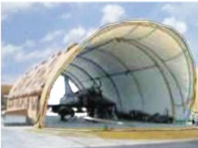
Portable all-Weather Maintenance Shelters for SU 30 MKI

To provide protection from environmental hazards and boost the morale of aircraft maintenance crew working on tarmac, 'portable all-weather maintenance shelters' have been procured for the first time by IAF for SU-30 MKI squadrons. Initially, 27 shelters have been procured for two squadrons and another 50 are in final stage of procurement.