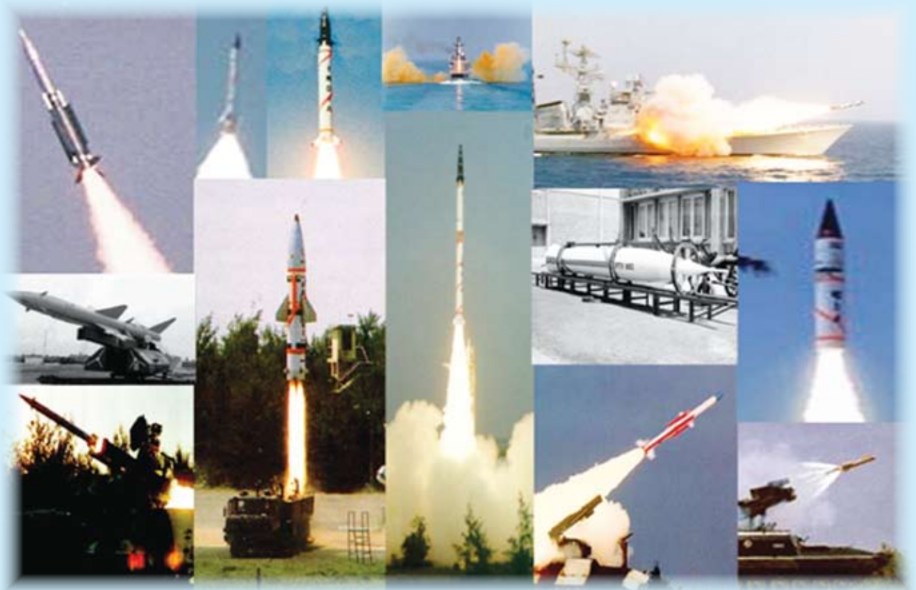
Missiles Developed by DRDO